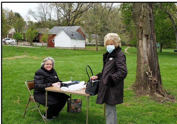
Above, L – R: